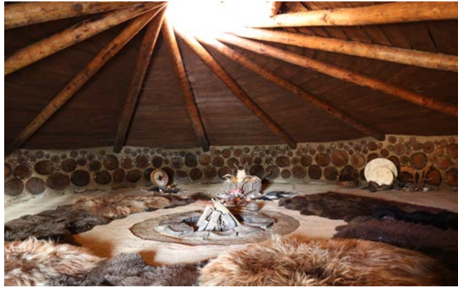
The beautiful ancestors EarthLodge for ceremonies