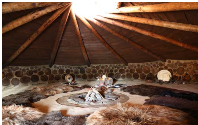
The beautiful ancestors EarthLodge for ceremonies